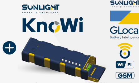
BMS data capture & upload in GLocal