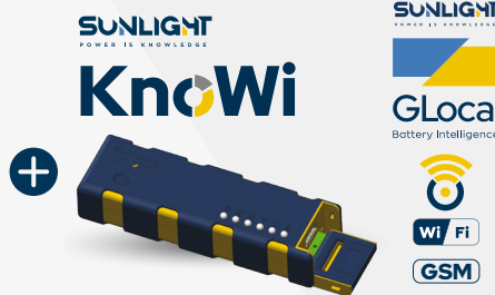
BMS data capture & upload in GLocal